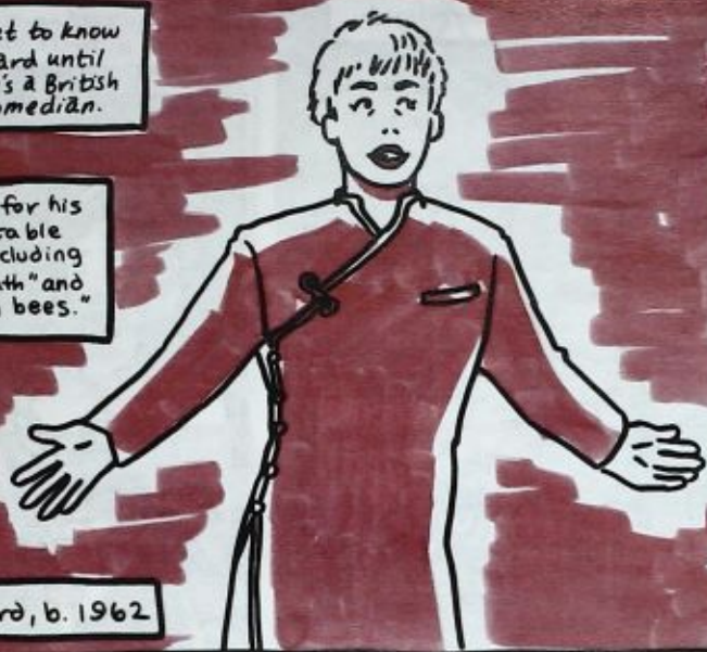
Eddie Izzard, b. 1962

He's known for his highly quotable routines, including "cake or death" and "covered in bees."